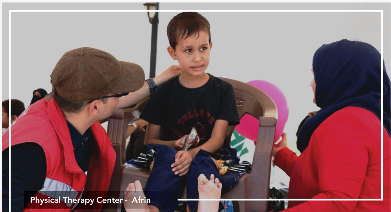
Physical Therapy Center - Afrin

"SDI" Organization opened a center for physical therapy and prosthetics in the city.