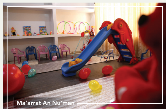
Ma'arrat An Nu'man