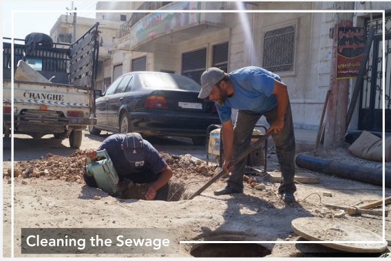
Cleaning the Sewage