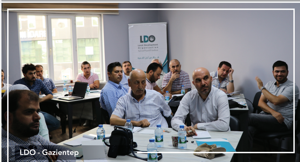
LDO - Gazientep

mation and experiences, expand discussions on local administration and governance in Syria, develop the strategic plan, build the capacity of these organizations, produce reports and research on the previous stage, and develop work in the local councils and governance sector in the next stages;