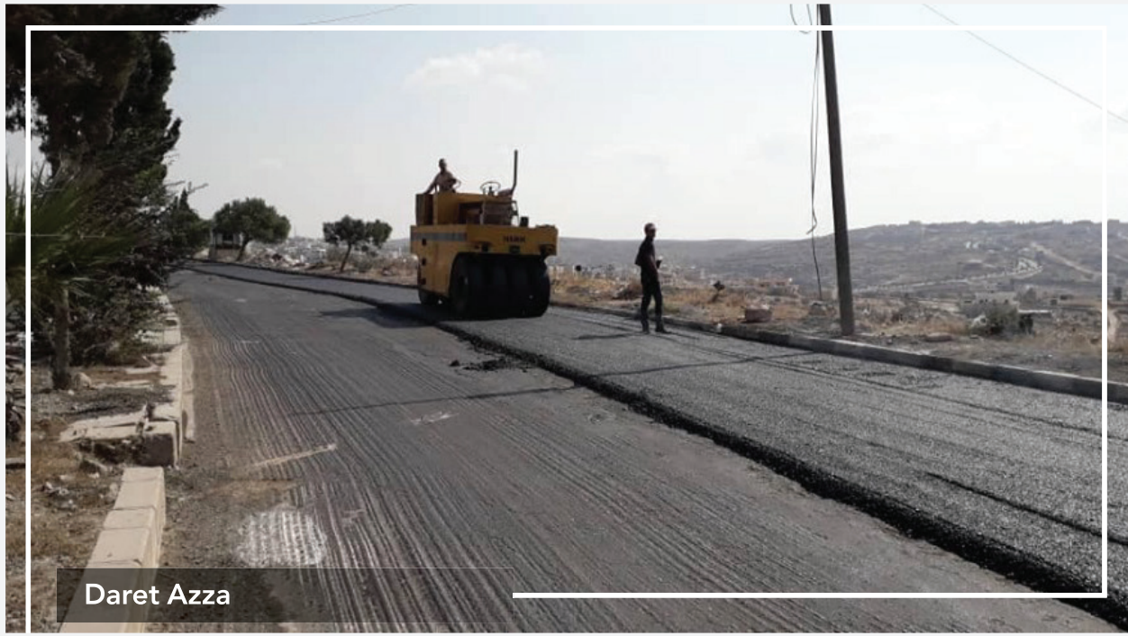
The Project of Maintenance of the western entrance of Daret Azza