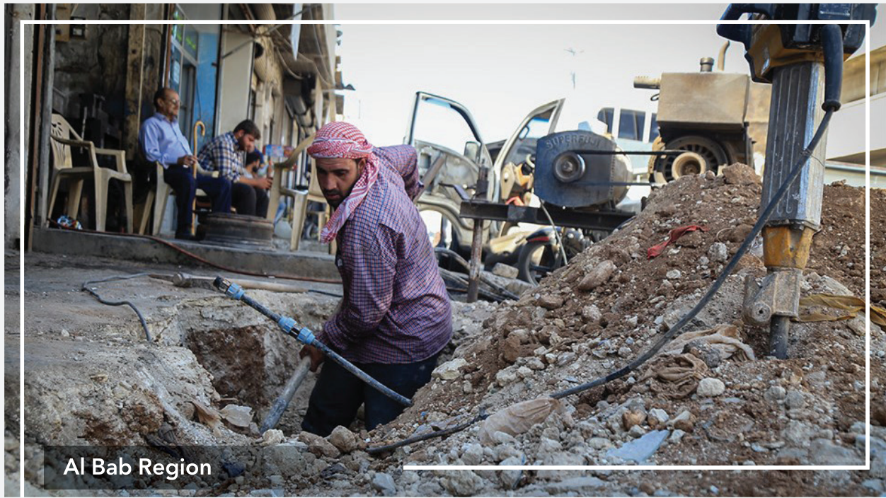
The first phase of the equipping the communication cabling infrastructure