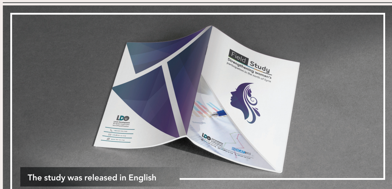
The Study of Empowerment of women participation in the north of Syria

3. In order to identify the situation of citizens’ security in various regions of Syria, and their views and perceptions on the security sector reform process, “The Day After (TDA)” Organization, and the Omran Center for Strategic Studies conducted a social survey entitled “Citizen Security in Syria: Reality and Prospects”. The survey will examine the daily suffering of Syrians, and their perspectives on the security situation, and its future trends in light of the complexity of the current political scene. Thus, it supports efforts to review and re-establish the structural and functional controls of the Syrian security services.