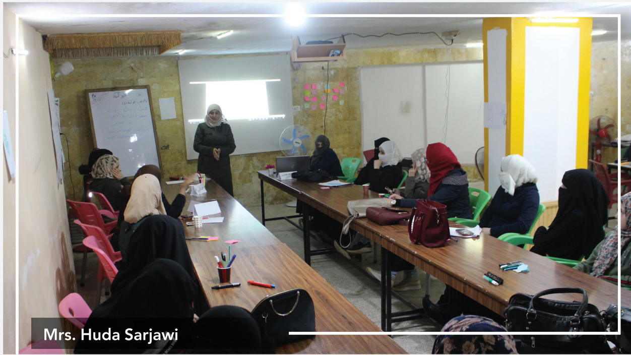
The Study of Empowerment of women participation in the north of Syria