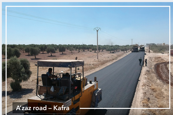
Paving the road of A'zaz – Kafra

The Council paved the road of "A'zaz - Kafra", which is considered the link with the surrounding cities, with a length of 9 km and a width of 7.30 cm.