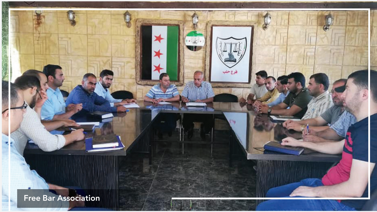
Free Bar Association

"The Free Bar Association – Aleppo Branch held a lecture entitled "Rules of Competence