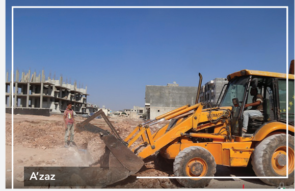
Expanding the water network – A'zaz

Gaziantep University opened a new branch, which includes "Faculty of Sharia" in A'zaz city.