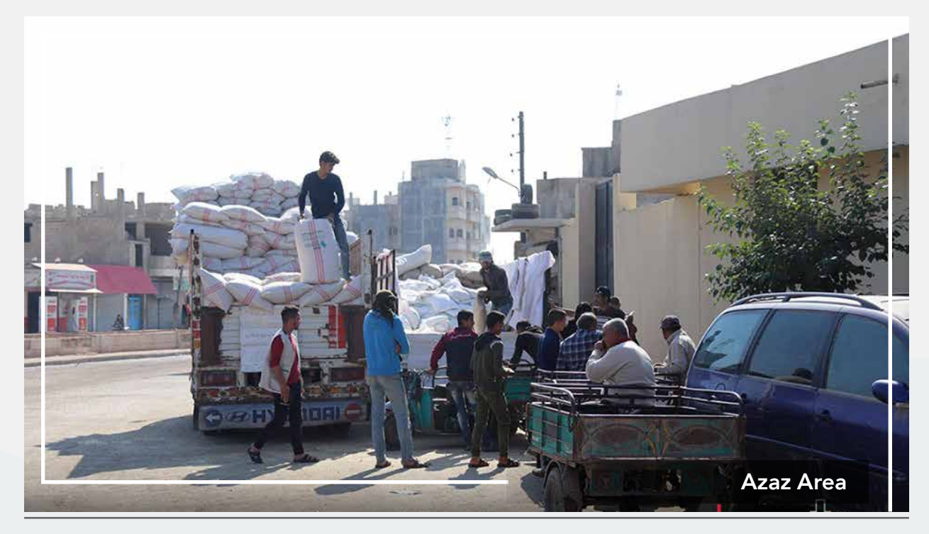
Distribution of Feed

conducted (sewing and tailoring - haircut - computer - nursing - Arabic calligraphy).