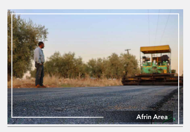
Paving the Road to Afrin National Hospital