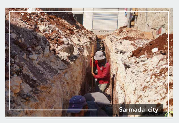
Extension of New Sewage Line

In cooperation with the local residents, the local council completed the extension of a new sewage line in Beit Al-Sheikh Street, as they have drilled and installed pipes of 140 meters length, 40 cm diameter and 170 cm depth at a cost of 400,000 SP.