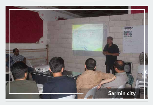
Project Management, Monitoring and Evaluation Training Course

The local council provided fuel to charity wells in the city (Bir Uthman and Bir Ghouth) at a subsidized price.