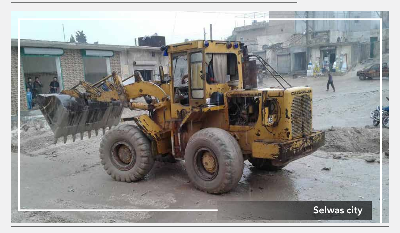
Cleaning and Repairing Roads

The service office at the local council cleaned streets and drainage holes by removing dust and dirt.