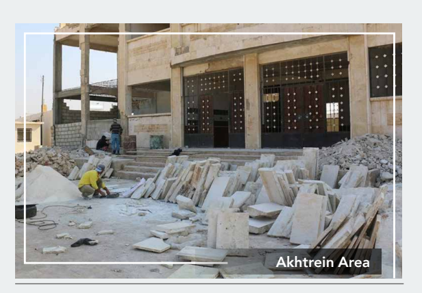
Rehabilitation and Restoration of Al-shuhada' School

The local council rehabilitated and renovated Al-Shuhada School in the northern neighborhood of Akhtarin.