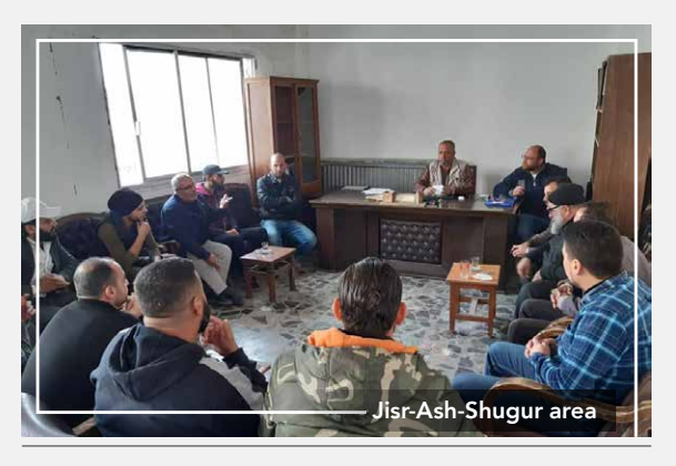
اجتماع المجلس المحلى مع المجالس المحلية

The local council declared the city stricken due to the continuous shelling by regime forces and the Russian occupation.