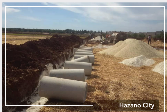
Delivering Water lines

IYD distributed water tanks (capacity of 1,000 liters) in 4 camps in Ma'arat Tamasrin countryside hosting 1,600 beneficiaries, as part of the plan to supply the newly displaced with safe drinking water.