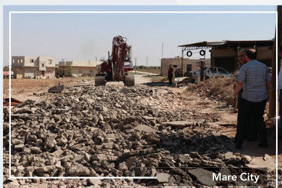
Renovation of Mare's Road - Kaljibrin

Funded by Shafaq Al-salamah town council extended 550 meterlong of the sewage line in the main market.