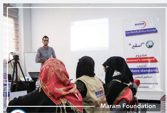
Sphere Standards Training

In cooperation with Aleppo Electricity Company, the local council finished street lighting installation.