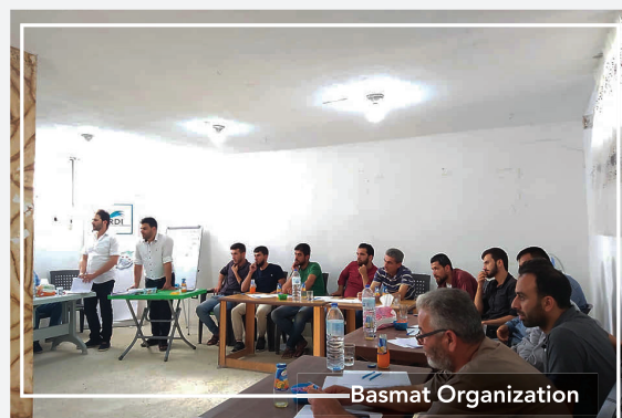
“Seminar “The Local Council Tasks and Challenges

Amal Foundation for Relief and Development has announced the opening of “Al Amal Center” for Social Support, which will offer many recreational and awareness-raising activities, capacity building and educational activities for women.