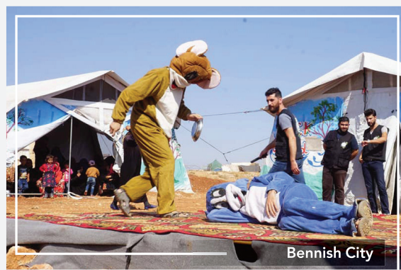
Al-Talia Camp for IDPs

The local council modified one of the water pipe lines in Al-Muhallaq Al-Shamali neighborhood in order to deliver water to that neighborhood.