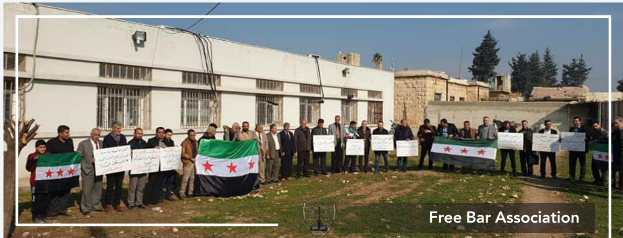
Free Bar Association

food baskets to the southern village of Marquez as part of relief campaigns by the local council.