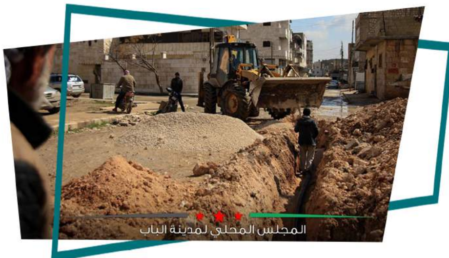
المجلس المحلي لمدينة الباب