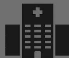
Facilities and infrastructure

The number of damaged Facilities and infrastructure during the military campaign: 20 shelters, 88 educational facilities, 32 health facilities, 8 ambulances, 9 civil defense centers, 14 bakeries, 31 places of worship, 23 other facilities.